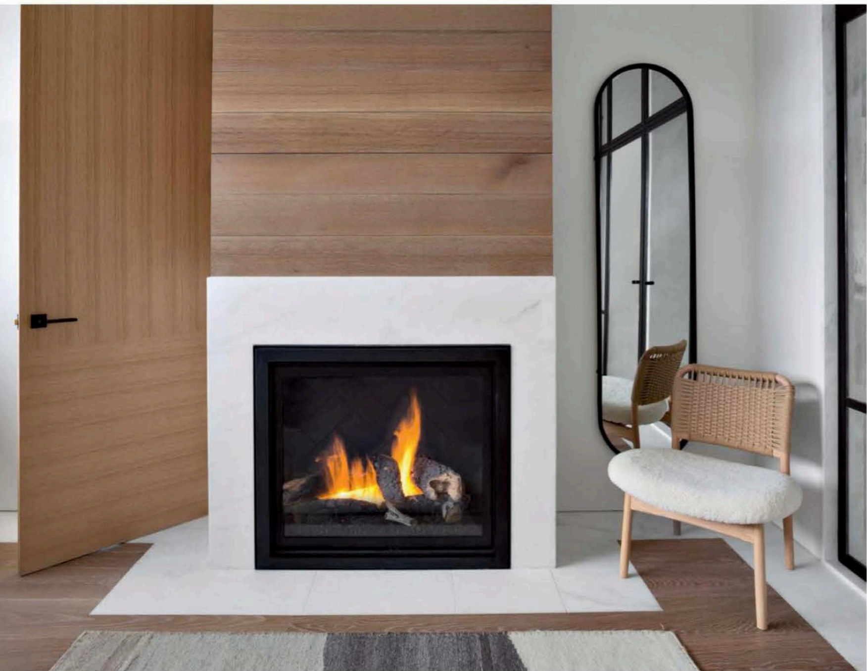
Above: The bathroom adjoining the homeowners' bedroom suite is designed for warming, post-ski soaks. The chair is from Gestalt in Hudson, New York.