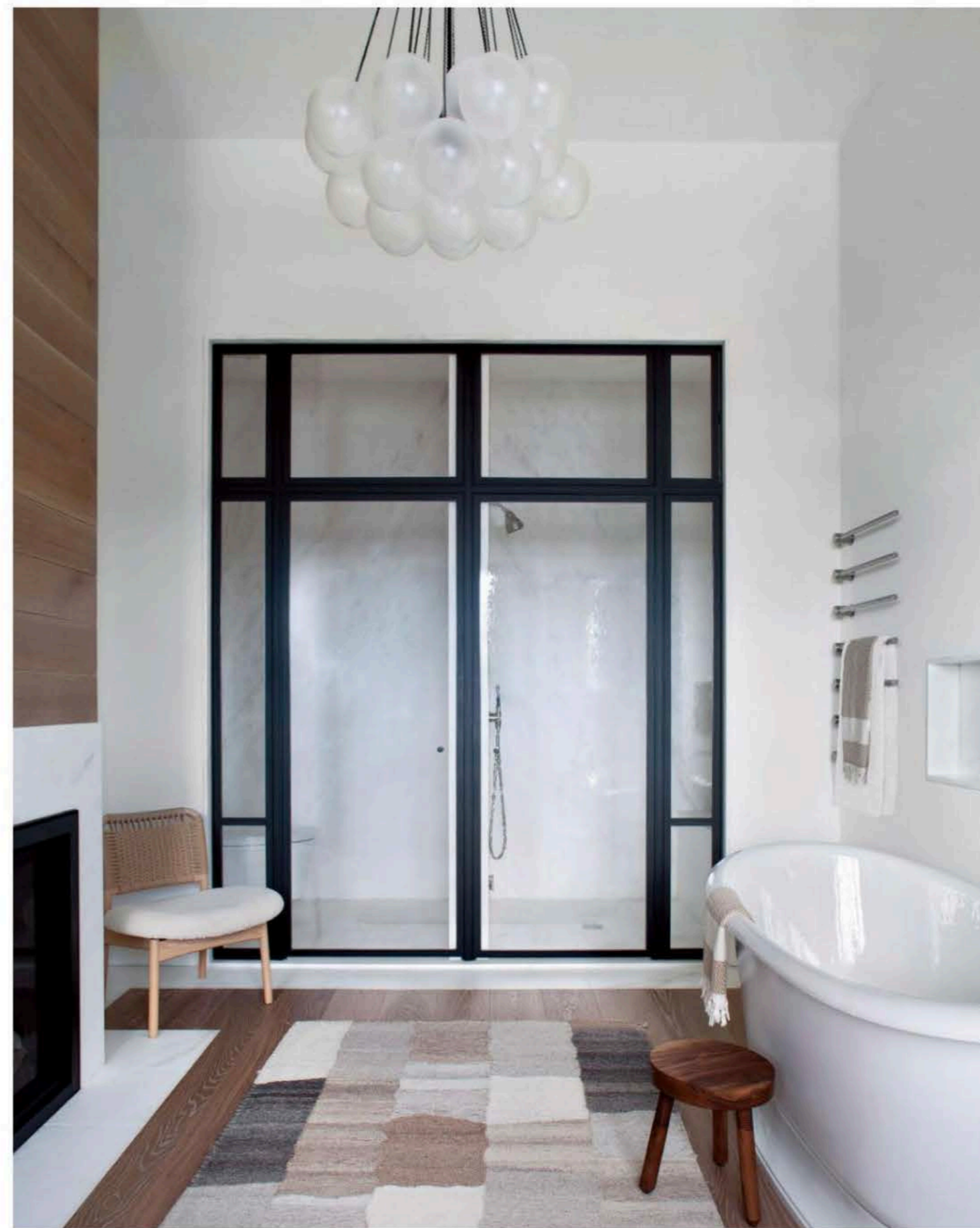
Opposite: A bubble-like chandelier by Apparatus draws eyes upward in the main bathroom. The freestanding tub is by Kohler and the shower fittings are by Vola. The vintage rug from Azadi Fine Rugs brings texture underfoot.